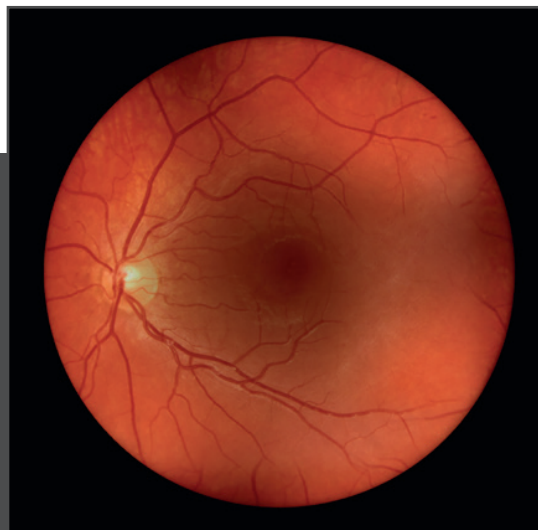
View of a retina through a cataract with visionBOOST*