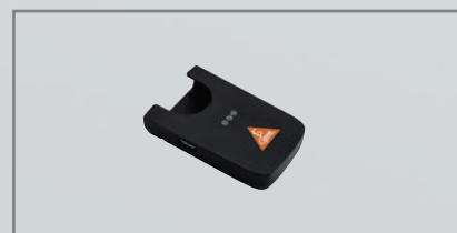
CC1 charging case [02]