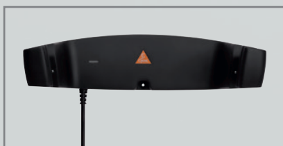
CW1 wall charger [05]