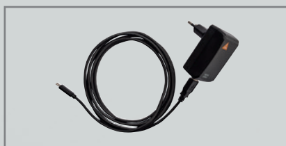
E4-USBC power supply with cable [04]